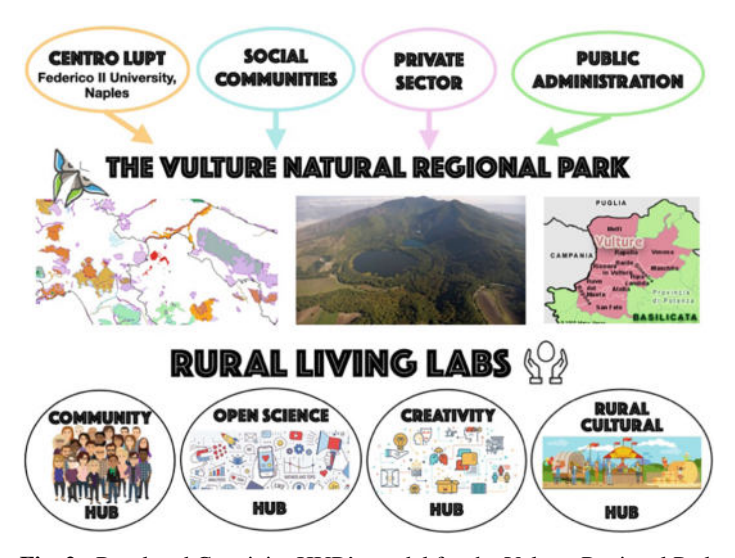
Fig. 2. Rural and Creativity HUB's model for the Vulture Regional Park

The creativity-based model of innovation that we have planned for the Vulture park (also sketched in Fig. 2) is coherent with the broader trends that define innovation itself. Indeed, the main difference with respect to traditional innovation policies is not so much in the object of the policy but in the way we view the innovation-related processes that policy is acting on. Traditional innovation theories describe a linear progression that starts with an idea that is then developed [44].